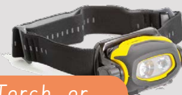
Torch or headlamp